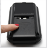
Back of tool